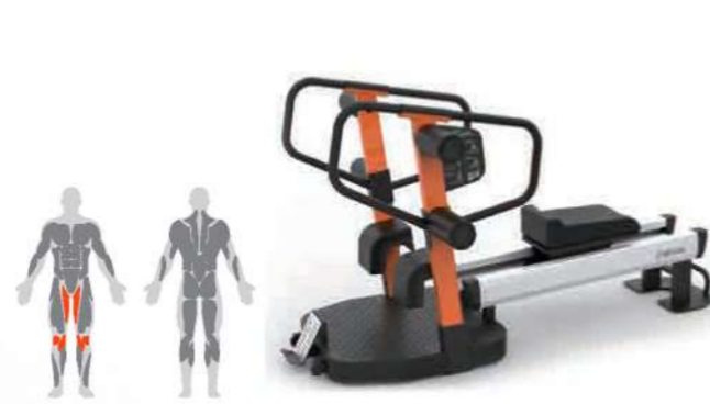
Stretcher | SH-G6912