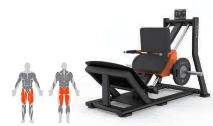
Linear Hack Press | SH-G6914