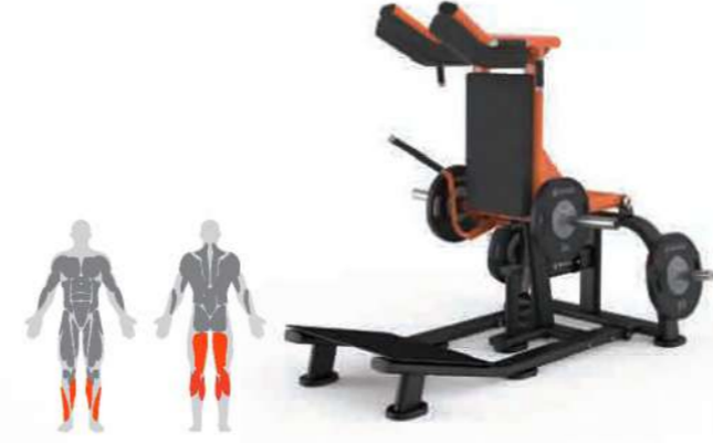
Hack Squat | SH-G6913