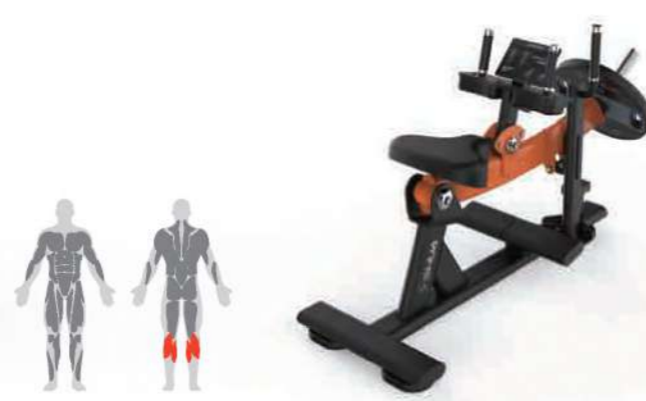
Calf raise trainer | SH-G6910