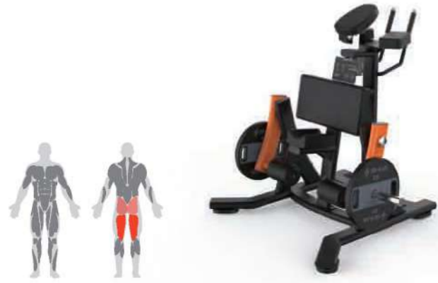
Split type leg curl trainer | SH-G6909