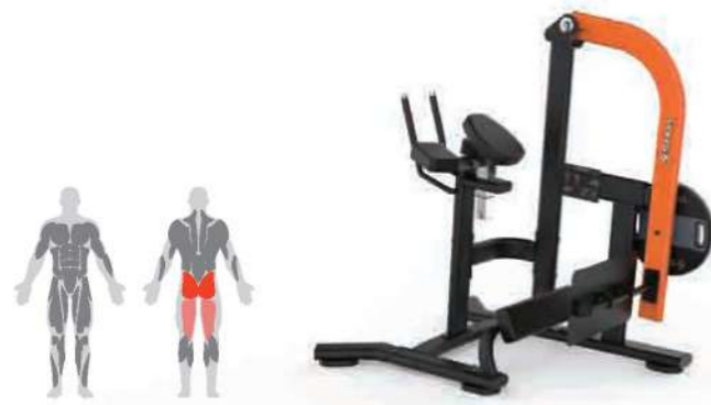
Buttock trainer | SH-G6911